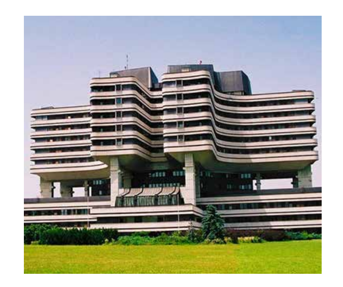
Clean Energy Flagship 6 • Renovation Wave