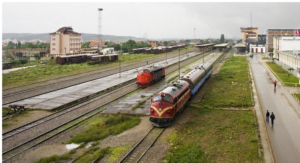
Fushë Kosovë/Kosovo Polje Railway Station.