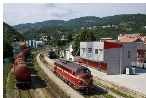
Hani i Elezit Railway Station at the border with North Macedonia.

This investment project covers the rehabilitation and upgrade of the