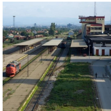
Fushë Kosovë/Kosovo Polje Railway Station.

This investment project will cover the rehabilitation of the Fushë Kosovë/Kosovo Polje – Mitrovicë/Mitrovica rail section and associated (five) railway stations. Once complete, the investments will allow for an increase in travel speed to 100 km/h and safe passenger and freight transport conditions. Whereas the project includes modern signalling and telecommunications, it excludes electrification.