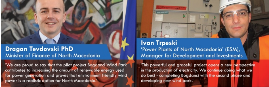
Dragan Tevdovski PhD Minister of Finance of North Macedonia

'We are proud to say that the pilot project Bogdanci Wind Park contributes to increasing the amount of renewable energy used for power generation and proves that environment friendly wind power is a realistic option for North Macedonia.'