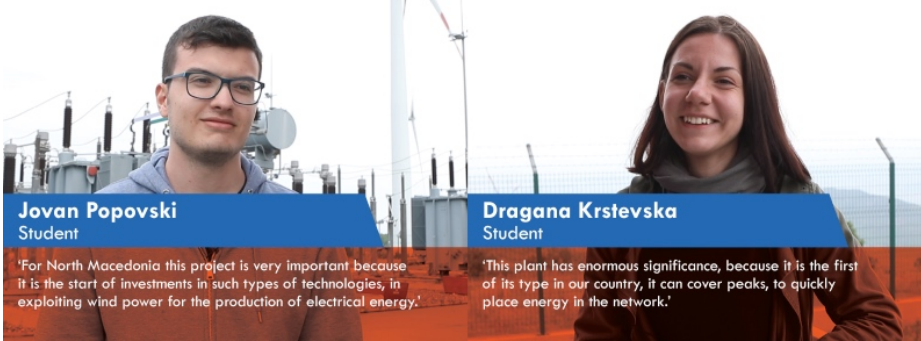
Jovan Popovski Student

'This powerful and graceful project opens a new perspective in the production of electricity. We continue doing what we do best - completing Bogdanci with the second phase and developing new wind park.'