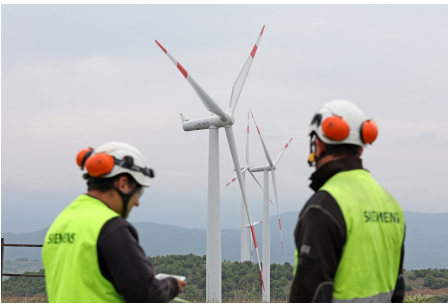
Bogdanci Wind Park Pilot Project.

Besides physical infrastructure, these investments will reduce existing barriers making the horizon of European accession visible and obtainable.