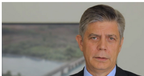
Lars-Gunnar Wigemark Former EU Ambassador and Special Representative to Bosnia and Herzegovina

These investments contributed to the achievement of the overall goals of the project: reducing the risk of floods while increasing the capacity of the national institutions and stakeholders for the management and implementation of multidisciplinary projects, transferring know-how in project development and financing strategies to local beneficiaries. More than 640,000 inhabitants have experienced the positive economic, social and environmental impacts in the region.