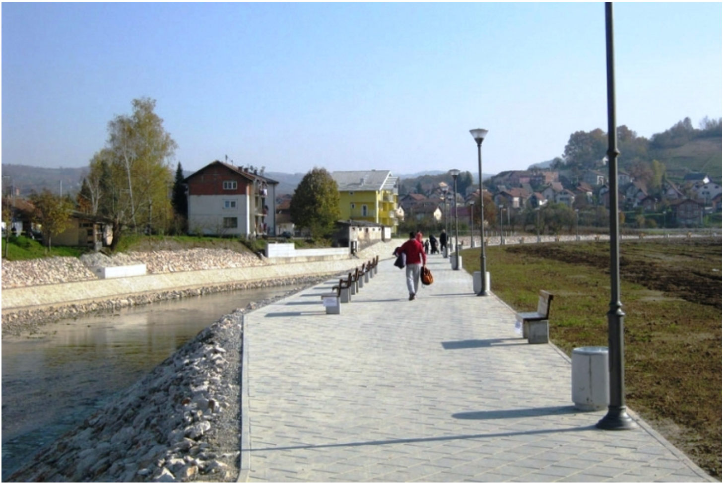
Reconstructed banks of Vrbanja River (c) EU.