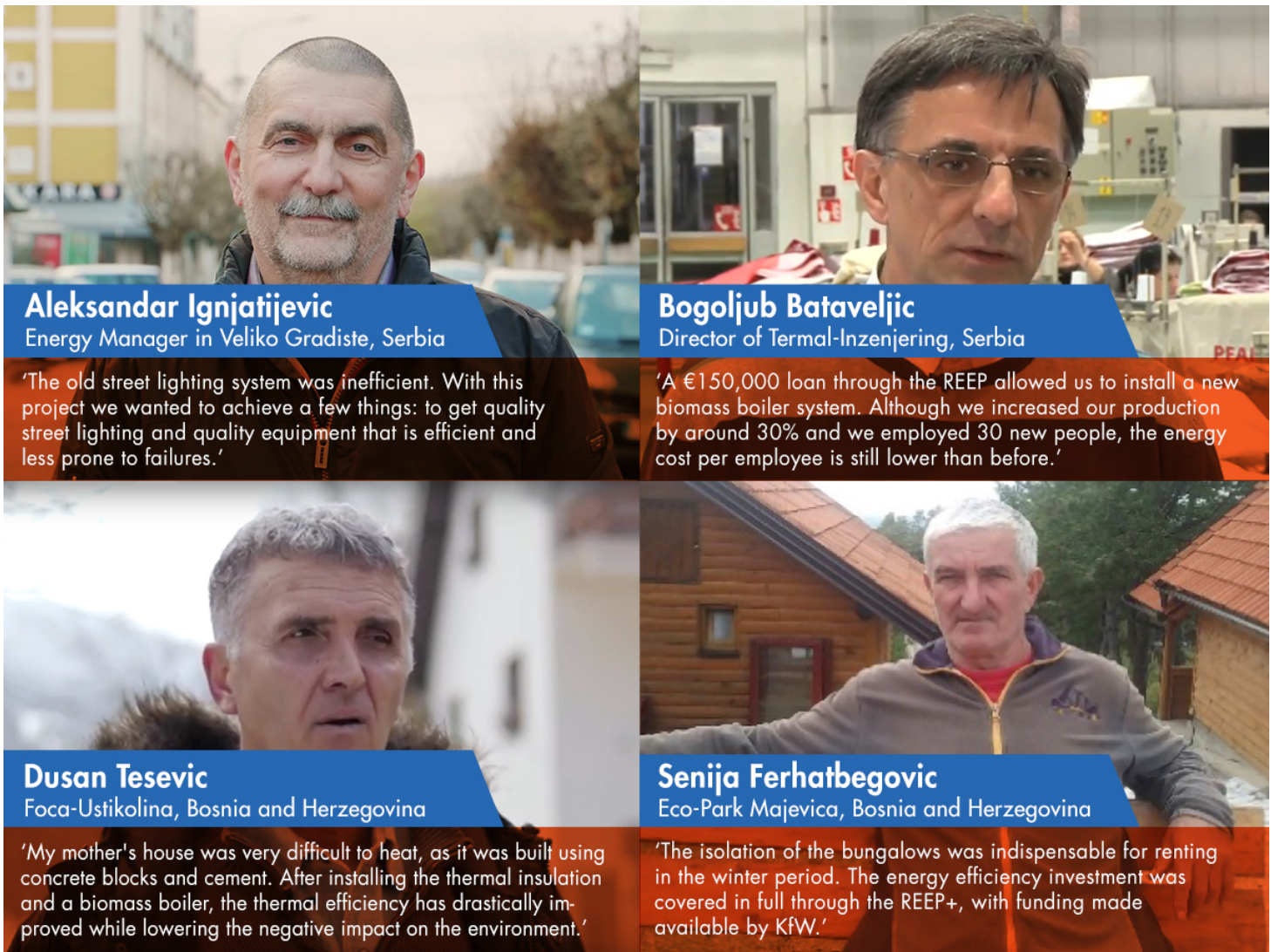
Project beneficiaries (c) EU.